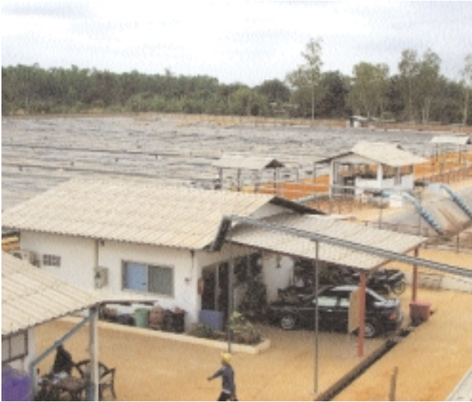
Overview of the digester energy plant

management risks that can otherwise prevent factory owners from implementing turnkey systems.