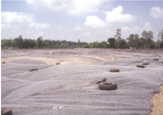
ABOVE The biogas-impermeable cover of the CIGAR digester BELOW The plant's Jenbacher GS 320 gensets

with sensors tracking all significant variables in real time, including wastewater flows, wastewater and sludge levels inside the CIGAR, biogas production rate, the methane and oxygen content of the biogas, and the pH level of the balancing pond. The SCADA (Supervisory Control And Data Acquisition) system incorporates a sophisticated touch-screen display to allow the operator to monitor all activity. Vital statistics are recorded in real time, allowing precise control and adjustment of the quantity, location, and pH of the influent.