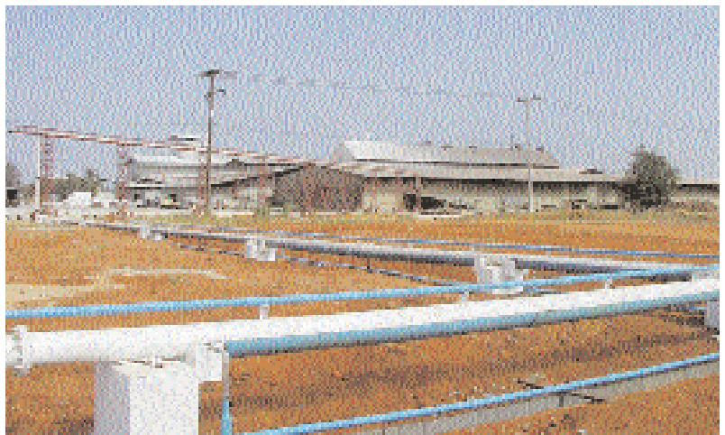
Biogas pipeline to the cassava plant

Cassava processing presents an ideal opportunity for distributed generation, coupling an excellent renewable resource with large heat and electricity loads. Significant energy is required to dry the starch, reducing its moisture content from 70%-80% to 15%-17% for bagging and shipment.