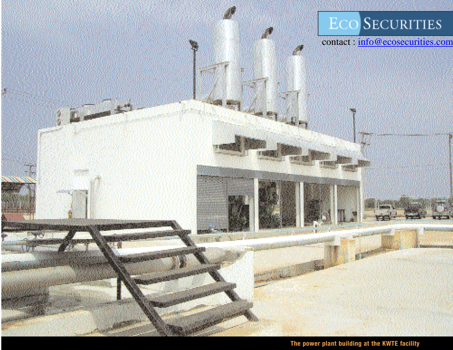
The power plant building at the KWTE facility